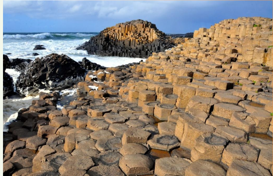
The Giant's Causeway

Long time ago a giant who lived in this causeway called Finn McCool decided to build a castle to live in this place. When he build it, other giant called Benandonner, jealous, destroyed the castle. This is because it is called The Giant's Causeway .