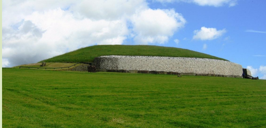
The Brú na Boinne

The Giant's Causeway is an area of about 40,000 interlocking basalt columns, the result of an ancient volcanic eruption.